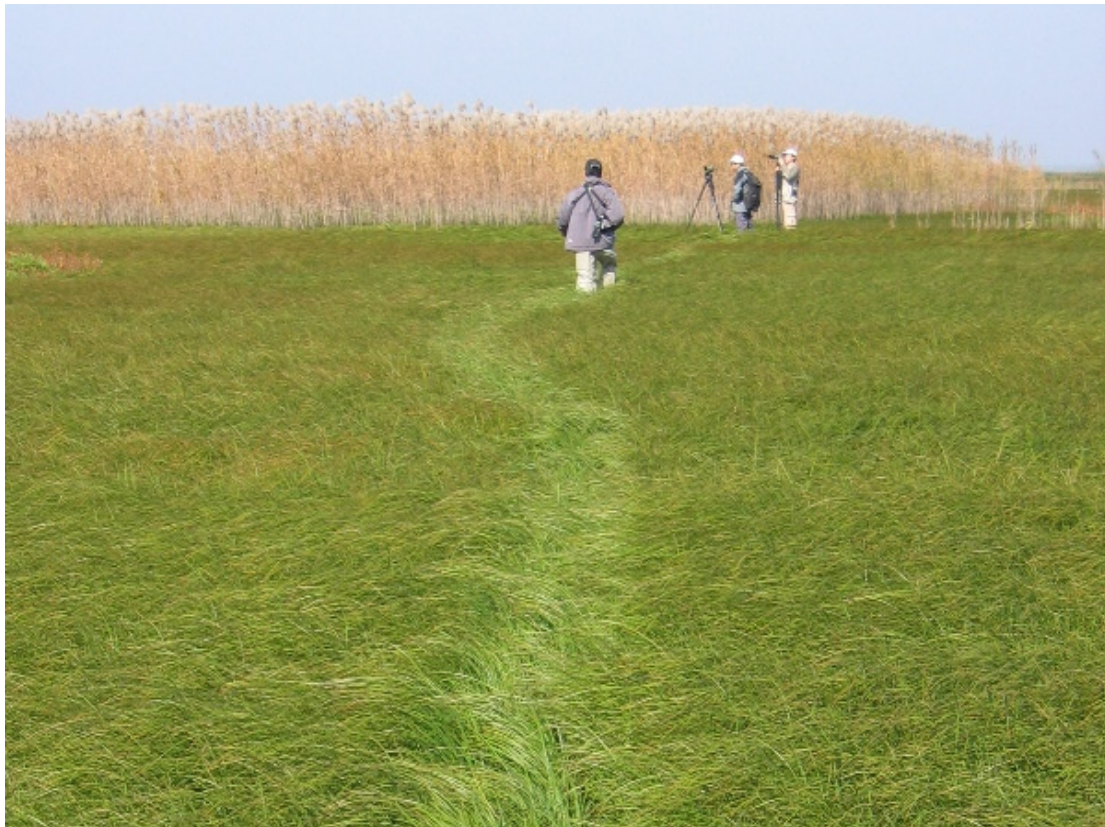
Dongting Hu Wetlands (CN438) is an important wintering site for waterbirds and is has the largest population of Lesser White-fronted Goose Anser erythropus in the world.

IBAs are represented on the map as circles proportional to their areas. Key: ● = Protected; ○ = Partially protected; ○ = Unprotected.